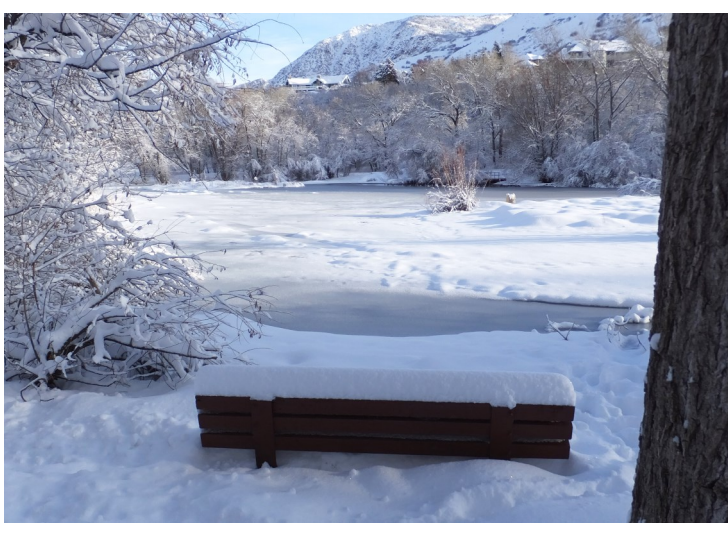
Wet Seat Birding, Jay Hudson (Beus Pond)